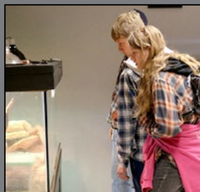
LEFT: During free day at the museum, visitors view the gila monster located on the top floor of the museum.